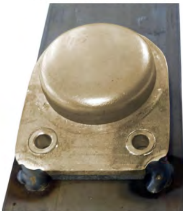
Correctly welded "spot" welds